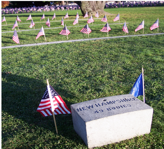
NH graves at Soldiers' Cemetery in Gettysburg

This year Epping is celebrating the town's 275 th Anniversary. On May 20 th , our Civil War Roundtable of NH is celebrating 25 years meeting in Epping. All are welcome to attend this and all of our meetings in the 2015/2016 season.